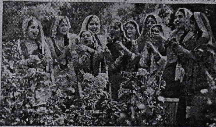
Schoolchildren perform giddha at the 51st Rose Festival in Chandigarh on Friday. PAGE 6