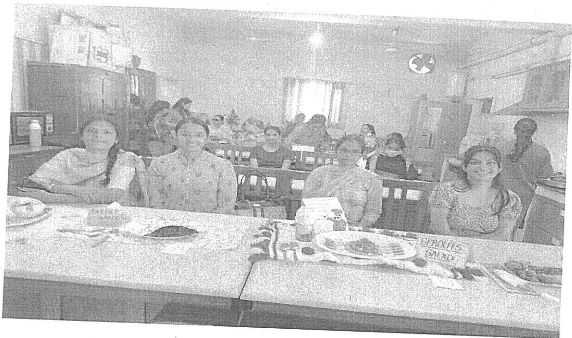
Students showing Salad