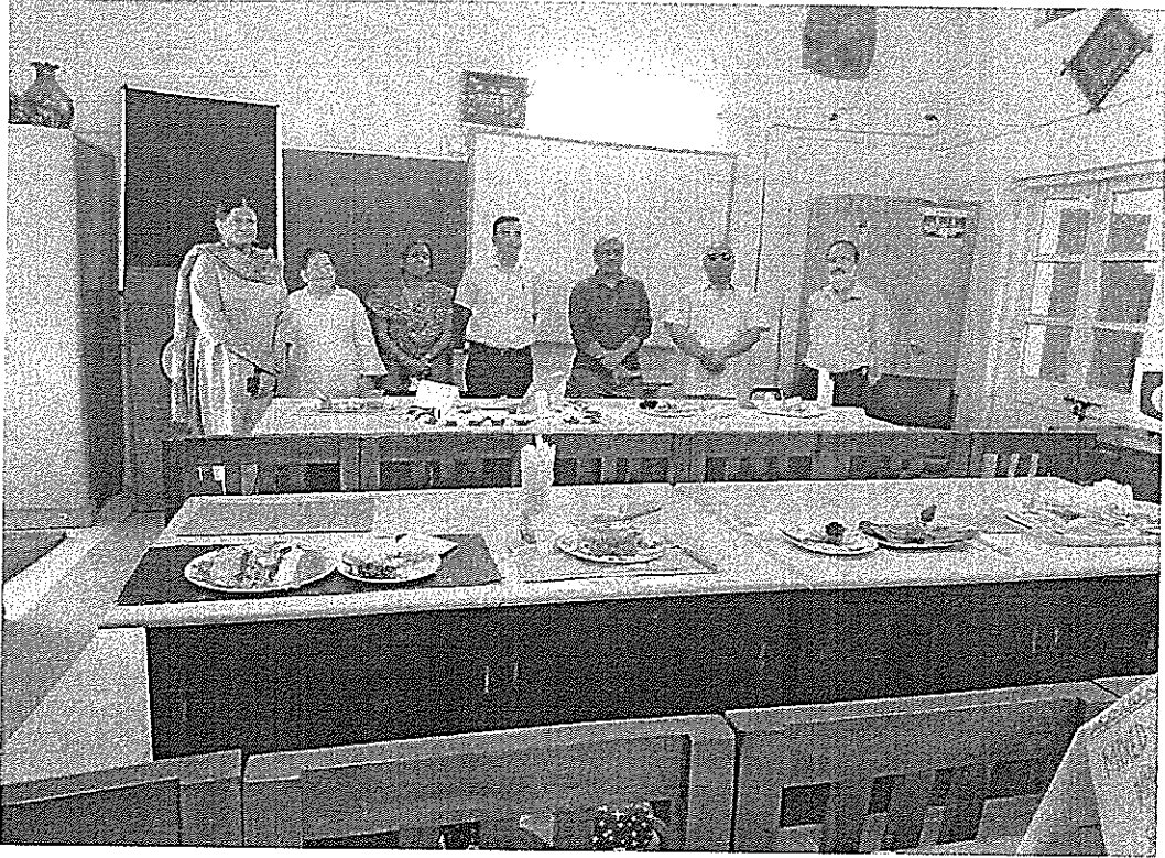
Staff Picture During the event