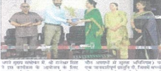
प्रतियोगिता कॉलेज ऑफ एजुकेशन, सेक्टर 20डी, चंडीगढ़ में राष्ट्रीय लीगल सेवा दिवस समारोह का आयोजन