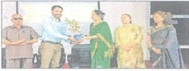
शासकीय शिक्षा महाविद्यालय, सेक्टर 20डी, चंडीगढ़ में राष्ट्रीय लीगल सेवा दिवस का आयोजन